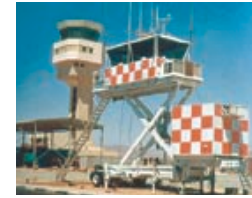
C ustom build systems with facility shelter

Our dedication and commitment to quality and service has earned us the respect of the most demanding customers.