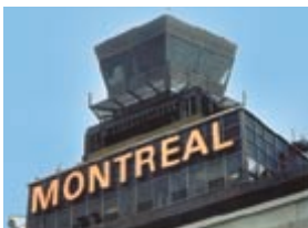
F ixed tower systems