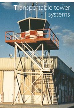
T ransportable tower systems