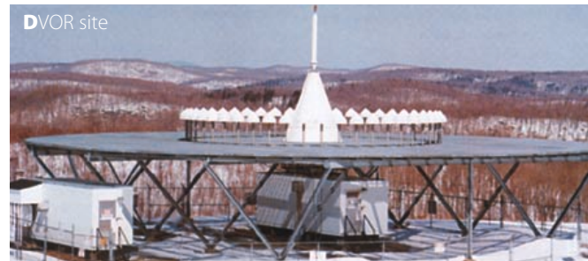
D VOR site