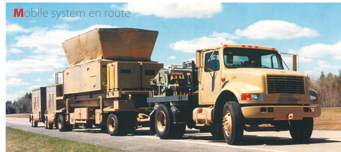
M obile system en route