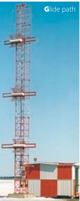
G lide path

With the acquisition of the Phillips Nav aids technology in 1993 through Canadian Marconi, NAI supports a complete product range of NAV AID S including ILS, (D) CVOR, and DME bases worldwide.