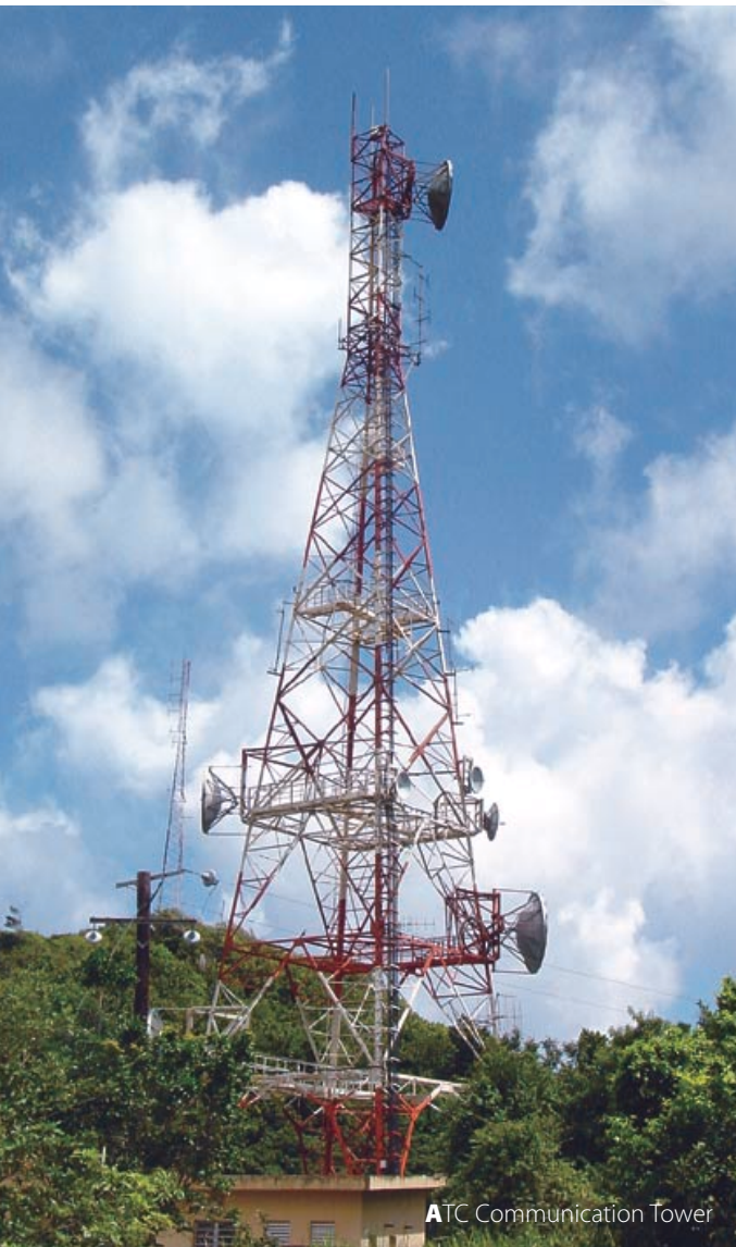
ATC Communication Tower

Navigation Aeronav International (NAI) offers global solutions services. Our technical capabilities and multidisciplinary approach to the implementation of ATC projects provide you with the advantage of a high quality, one stop supplier of worry-free ATC solutions.