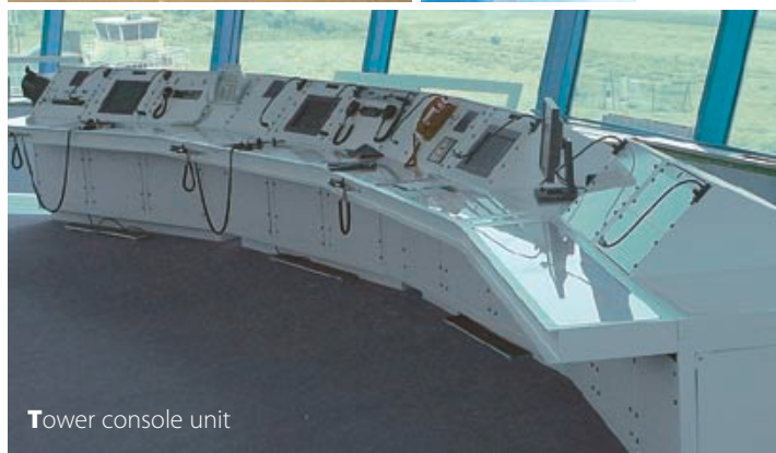
Tower console unit